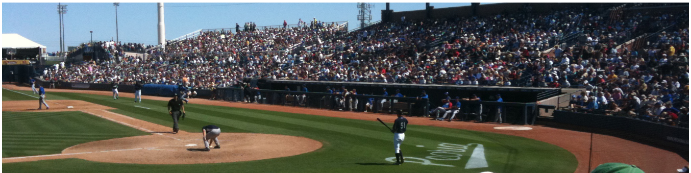
FIGURE 1: Ceci est un "teaser", c'est optionnel, vous n'en mettez un que si vous le souhaitez