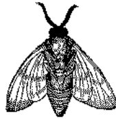
FIGURE 3: A sample black and white graphic that has been resized with the includegraphics command.

the input file ; again, it is instructive to compare the placement of the table here with the table in the printed output of this document.